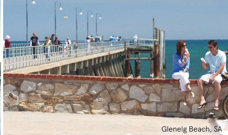
Glenelg Beach, SA